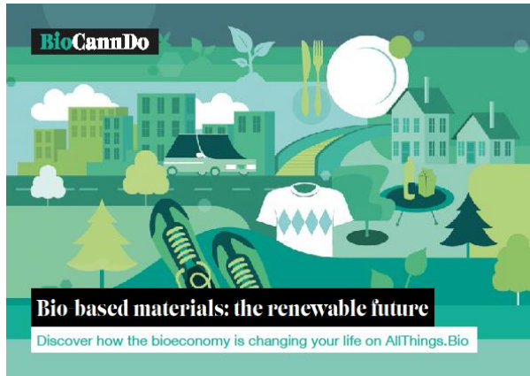
Picture 2 – The BioCannDo leaflet (please click on the image to open the file)