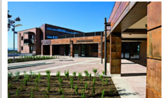
PERROTIS COLLEGE CAMPUS OF AMERICAN FARM SCHOOL

Master on Bioeconomy and Circular Economy-BIOCIRCLE Italy www.masterbiocirce.com