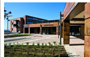
PERROTIS COLLEGE CAMPUS OF AMERICAN FARM SCHOOL

Master on Bioeconomy and Circular Economy-BIOCIRCLE Italy www.masterbiocirce.com